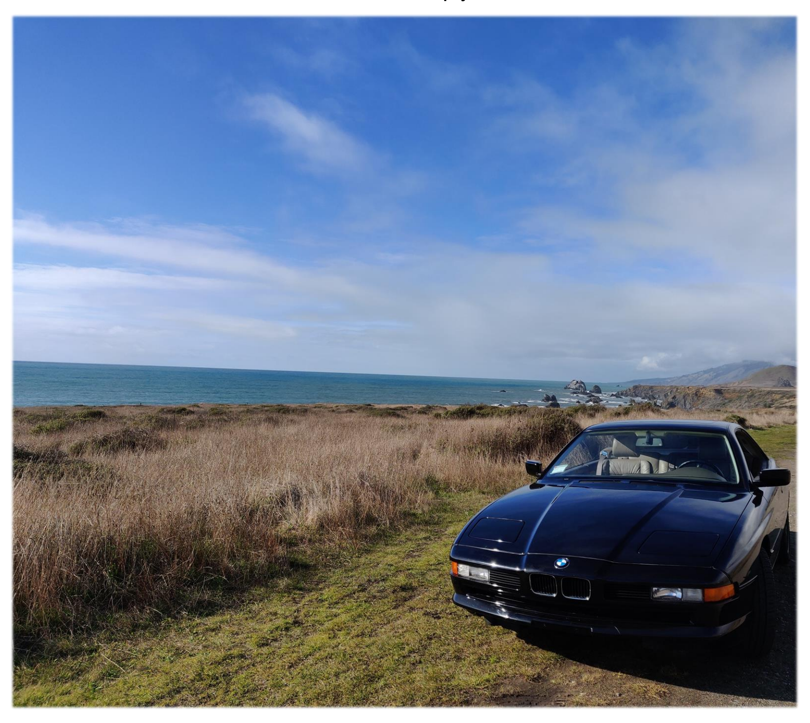
Additional Photo Contest Entries...