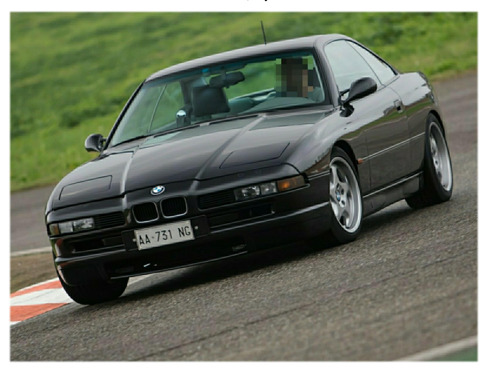
Additional Photo Contest Entries...