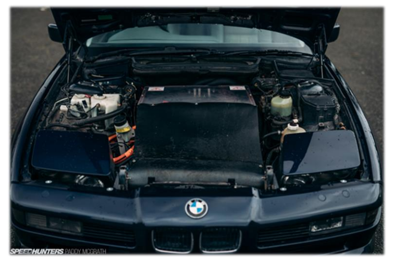
The ZF automatic was replaced with a Getrag 5-speed manual gearbox which fared much better from an efficiency perspective, but that too exited this world in style, with the layshaft coming through the gearbox casing following an attempted J-turn manoeuvre. Version 3 saw the introduction of a 6-speed ZF manual which happily turned out to be J-turn proof, and the car ran happily for about a year.