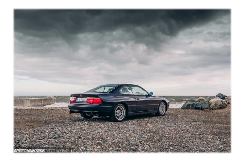
In 2014, Damien found the right E31. Following a train journey to Newry in Northern Ireland, he paid the lowly sum of £2,000 for what he describes as a "pretty rough" 1996 840Ci. It might have been a bottom-of-the-market example, but it still made the journey back to his home in Wexford, albeit after consuming some €82 in petrol courtesy of its woeful 14mpg fuel consumption.