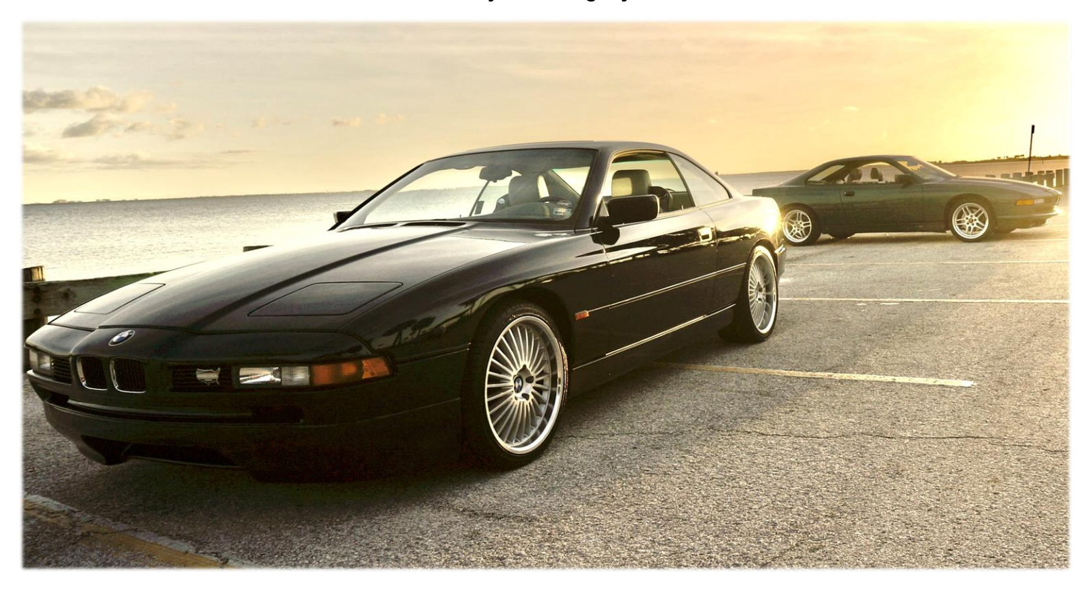
Additional Photo Contest entries...