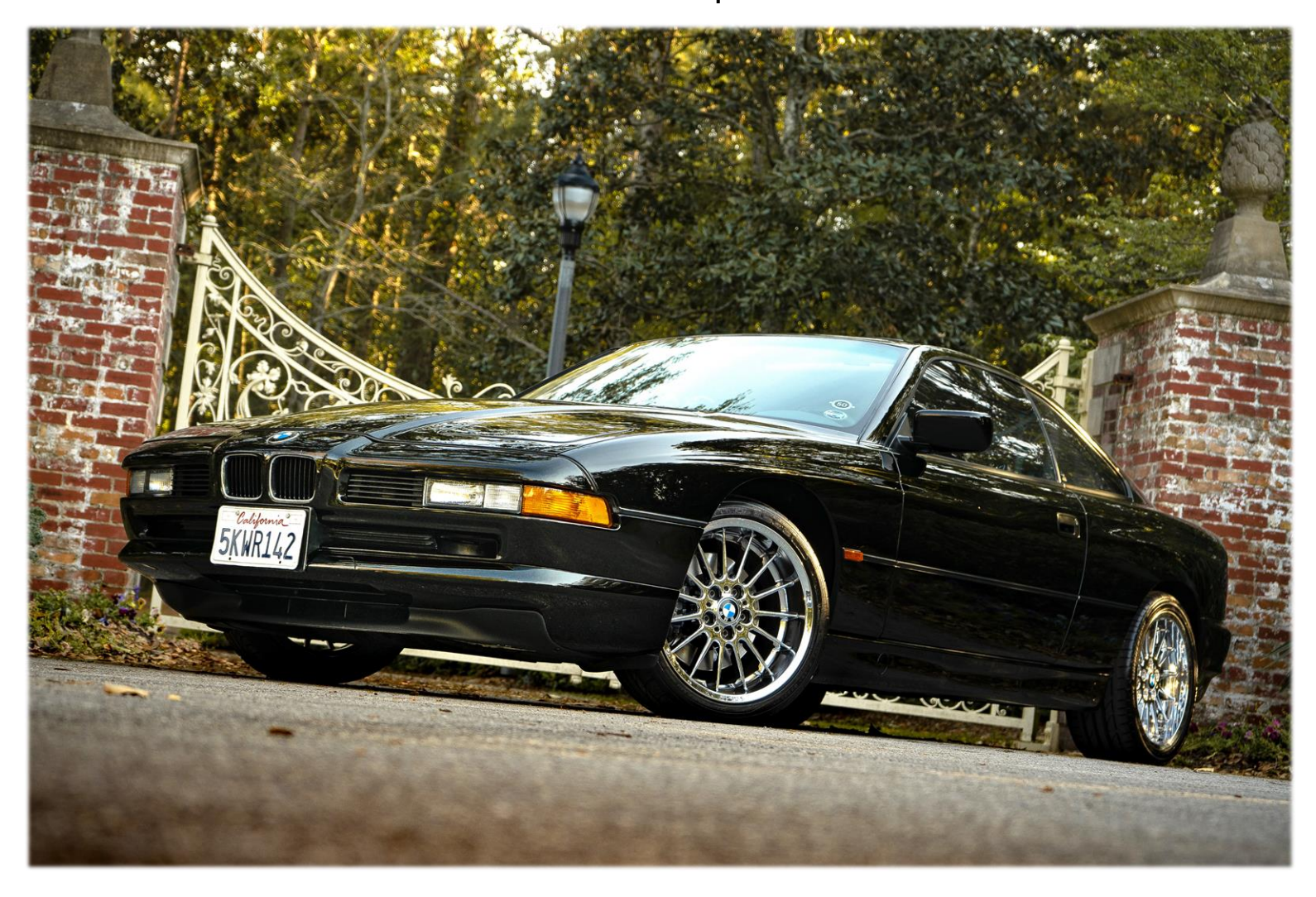
Additional Photo Contest Entries...