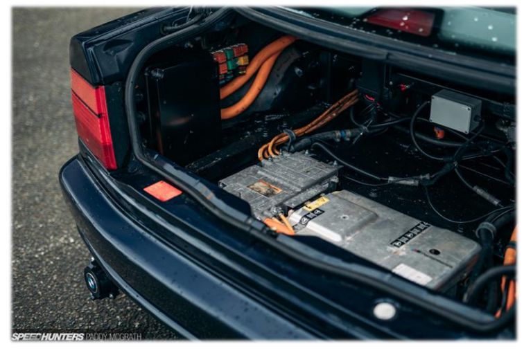
Besides, since when is removing nearly 200kg (441lb) and adding over 100hp and nearly 80lb-ft of torque a bad thing anyway?