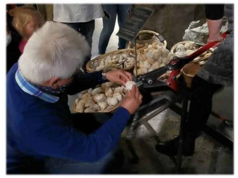
Because it was so beautiful, there was an entry in the guest book.

Well done... That's just how it is ... The special thing about this museum is: The owner, who financed everything privately, has salvaged the exhibits with the prospectors and organized the transport to Germany. A unique museum, that is probably unique in Europe. At the exit of the museum, visitors were able to pick out stones from a basket and buy them. The stones were then opened together and everyone could admire the beauty of the stones.