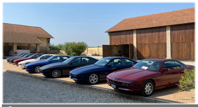
© 2020 BMW Car Club of America E31 Chapter

Unfortunately, due to the COVID health emergency, the BMW E31 Club Italia Third National E31 Rally scheduled for May 2020, which had many attending from other countries, was moved to May 2021 with the same passion and determination. To close the year with the pleasure of meeting members, local gatherings were held in three Italian macro areas: North West, North East and Center - Rome, with the intent of sending each member back to next year's 2021 national meeting.