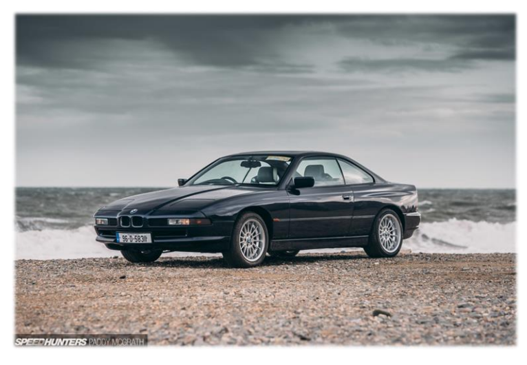
a ZF automatic gearbox with a custom shift controller and Renault Fluence battery packs. This was the first of five electric iterations of this car, which came to an end when an incorrect software parameter saw the motor rev to 9,000rpm, ejecting the torque converter through the bell housing.